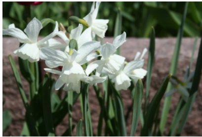
Narciss 'Thalia' (30cm)