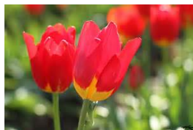
Tulpan 'Juan' (45cm, Tidig-Mid)