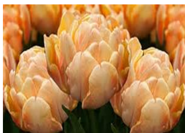
Tulpan 'Foxy Foxtrot' (30cm, Mid)