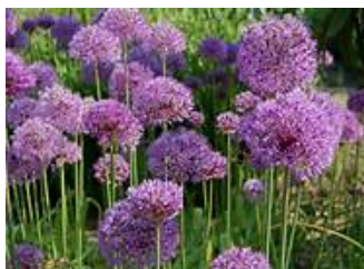
Allium 'Purple Sensation' (80cm)