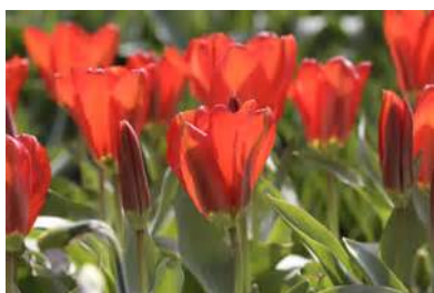
Tulpan 'Madame Lefebvre' (40cm, Tidig-Mid)