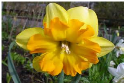
Narcissus 'Tiritomba' (45cm Mid)