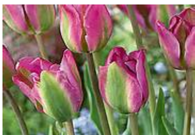
Tulpan 'Nightrider' (50cm, Sen)