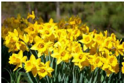
Narciss 'Marieke' (45cm, Tidig)