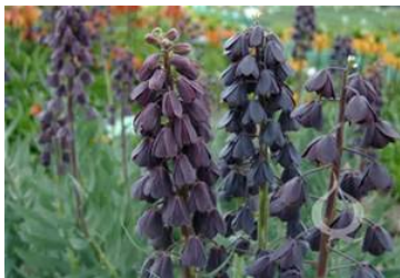
Fritillaria persica (100cm)