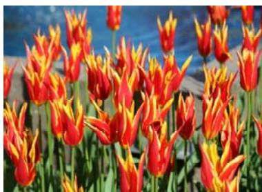
Tulpan 'Fly Away' (50cm, Mid)