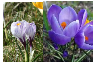
Crocus Pickwick Crocus vernus 'Grand Maitre'