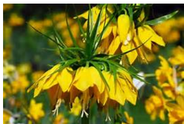
Fritillaria imperialis 'Lutea Maxima' (90cm)