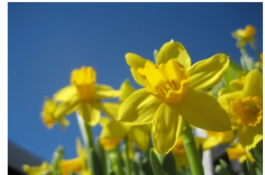
Narcissus Teté teté