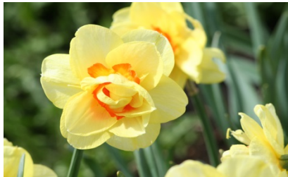
Narciss 'Tahiti' (45cm, Mid)