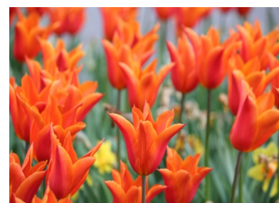
Tulpan 'Ballerina' (45cm, Sen)