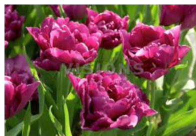
Tulpan 'Showcase' (35cm, Mid)