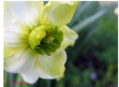
Narcissus 'Green Garden' (40cm)