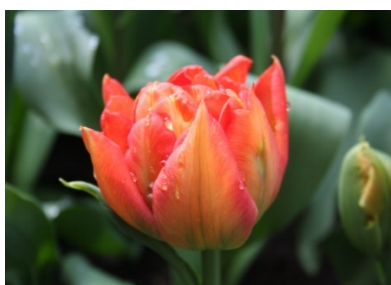
Tulpan 'Monte Orange' (25cm, Mid)