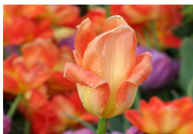
Tulpan 'Orange Emperor' (40cm, Tidig-Mid)