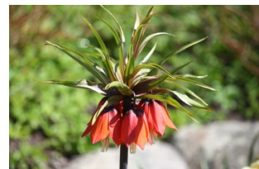
Fritillaria imperialis 'Rubra Maxima' (90cm)