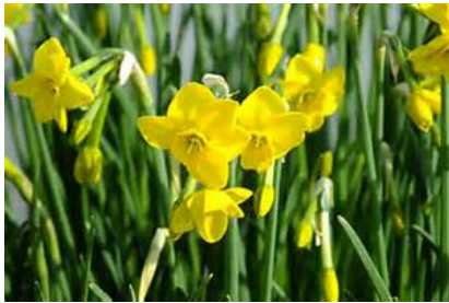
Narciss Kokopelli (35cm, Mid)