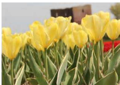
Tulpan 'Easter Moon' (45cm, Tidig)