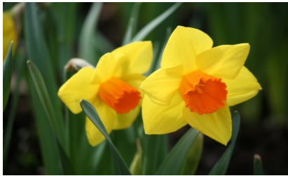
Narciss 'Brackenhurst' (40cm)